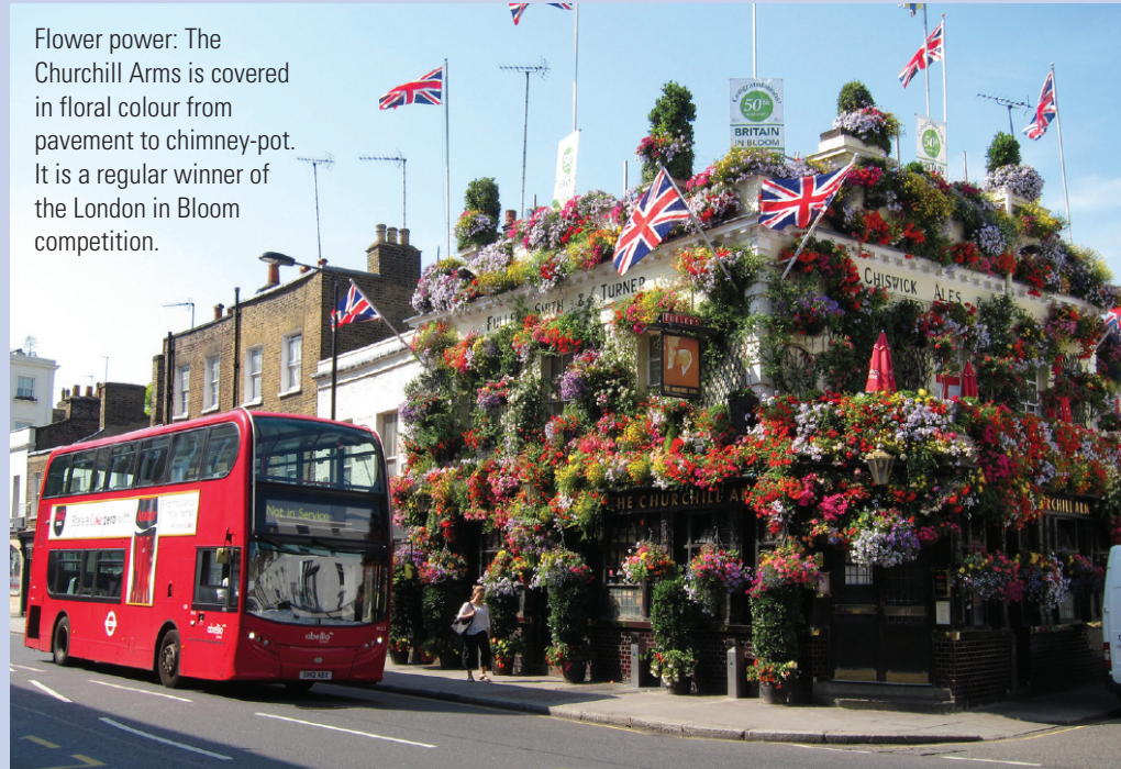
Flower power: The Churchill Arms is covered in floral colour from pavement to chimney-pot. It is a regular winner of the London in Bloom competition.