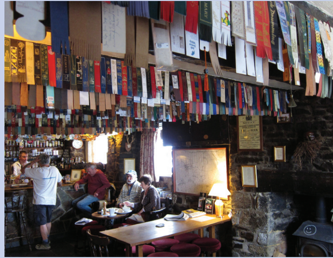
Some of the hundreds of bookmarks decorating the bar of the Grove Inn, King's Nympton.